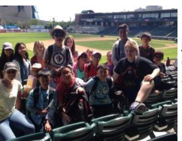
Middle school students enjoyed a day at the Goldeyes Game on June 2. The Goldeyes played the Sioux Falls Canaries.